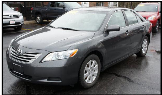
Similar 2009 Toyota Camry